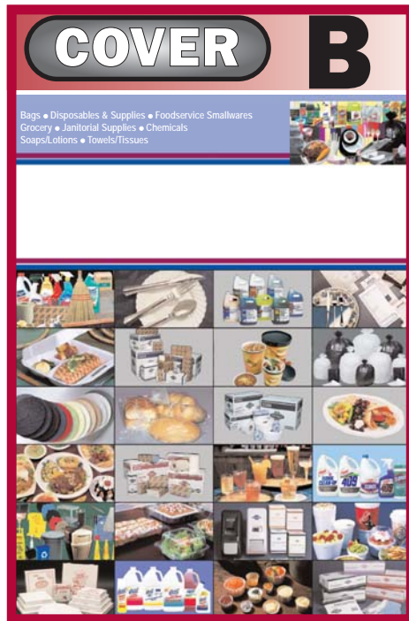
Item # COVERB2007