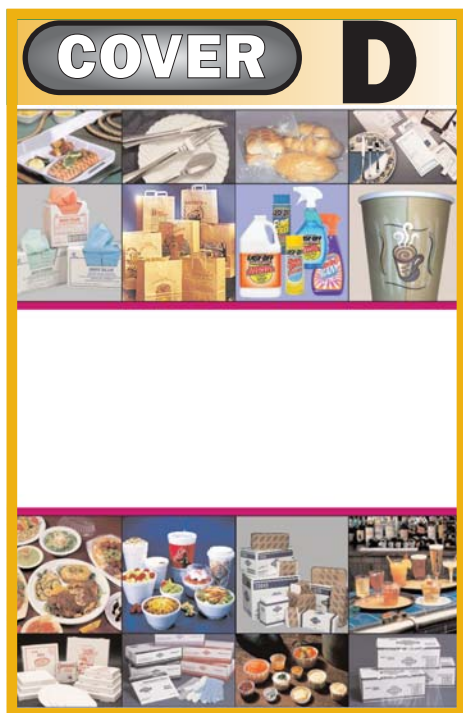
Item # COVERD2007