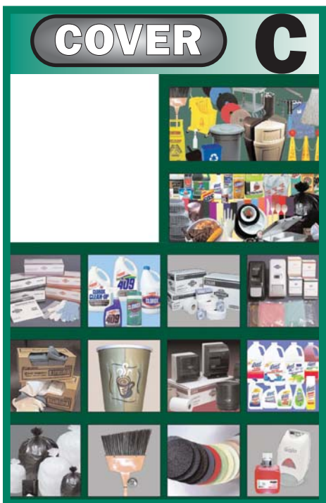
Item # COVERC2007