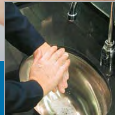
2 Rub hands together to make a lather and scrub all surfaces.