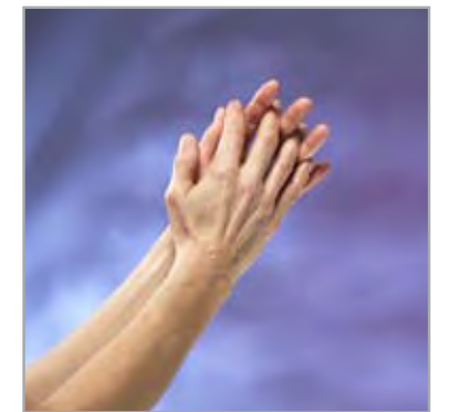
3 Rub the product over all surfaces of hands and fingers until hands are dry.

Washing with soap and water is the easiest and most effective way to prevent illness.