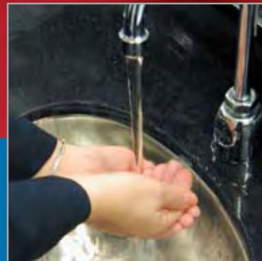
1 Wet your hands with clean running water and apply soap. Use warm water if it is available.

Washing with soap and water is the easiest and most effective way to prevent illness.