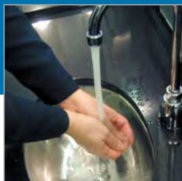
4 Rinse hands well under running water.