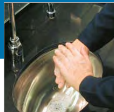
3 Continue rubbing hands for 15-20 seconds. Need a timer? Imagine singing "Happy Birthday" twice through to a friend.